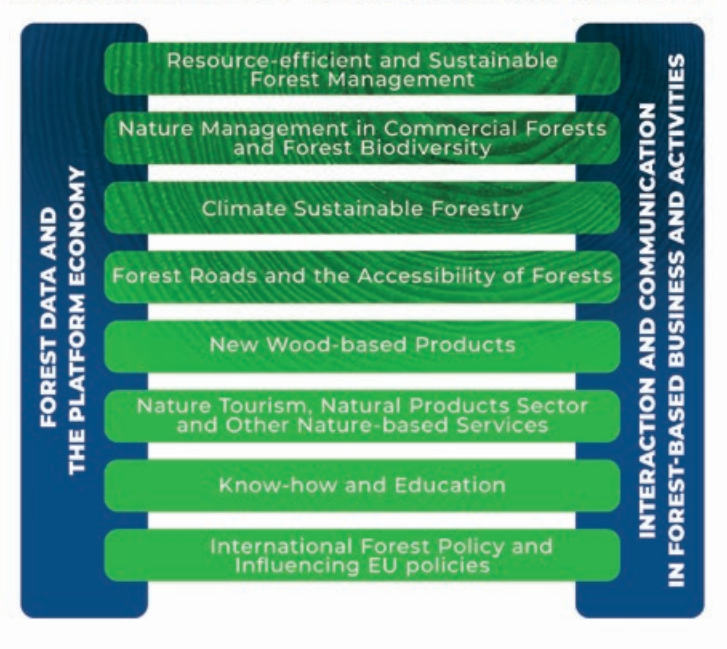
Figure: The Updated National Forest Strategy includes 10 strategic projects.