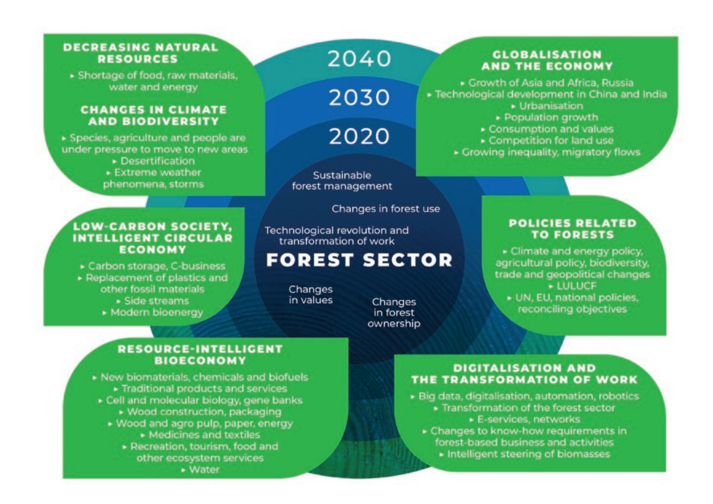
Figure: Key global megatrends that affect the forest sector.

Objectives related to sustainable development will influence the forest sector's development both in the short and long term. These are reflected in Finland's forest sector, for example, through the export of forest industry products, forest use as well as international policies that are related to and affect forests.