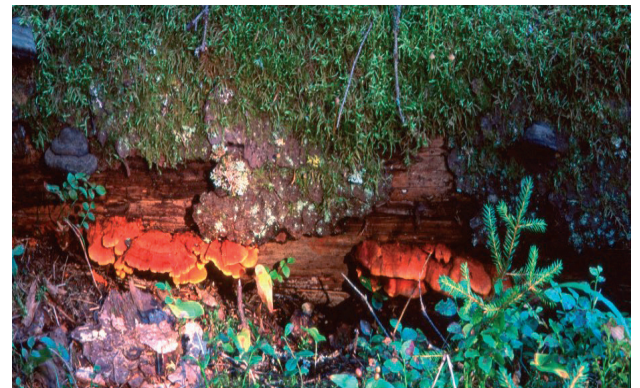
Forest certification has had positive effects on the preservation of biodiversity in forests.