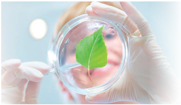
The first biomedical solutions and commercial applications made of biofibrils have been launched for cell cultivation by UPM.

We have invited specialists in the bioeconomy field to compile articles for a publication. In addition, inter-views with key actors are included, representing the core of the ongoing transformation process in the bioeconomy field. On behalf of all who have contributed to the publication, we hope that the information package will stimulate dialogue and contacts from a variety of stakeholders, both in Europe and more widely in the global context.