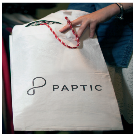
Plastic waste in the environment can be reduced by replacing plastic bags with wood-based bags.

For new pilot and demonstration facilities, major investments have been made, helping start-ups and established companies to test their inventions and accelerate their transition from basic research to commercialisation. In the national innovation system, new multidisciplinary knowledge concentrations have been formed and they function as seedbeds for radical process and product innovations and educate specialists for knowledge-intensive services.