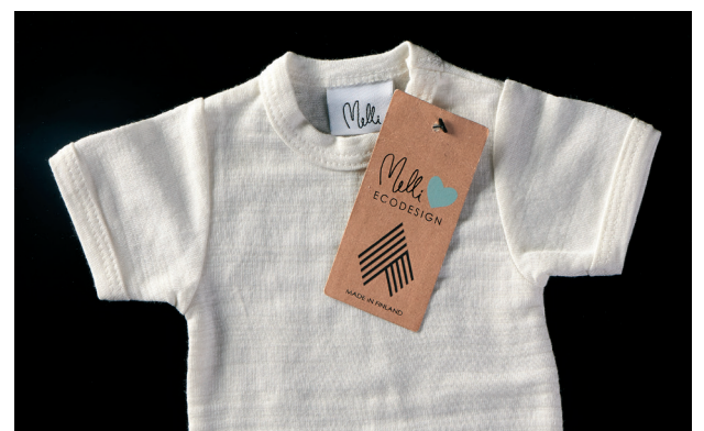
Baby Tree-shirt, made from Spinnova's 100% wood-based fabric. Photo: Spinnova.